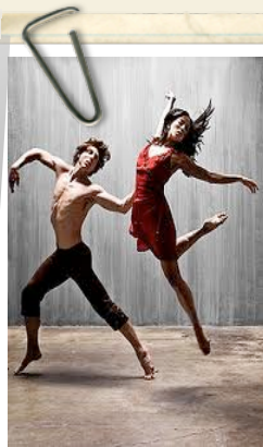
Dance at U Washington

826 Seattle is a nonprofit tutoring center dedicated to helping students improve their narrative and expository writing skills. While there, my class worked together to write a 'choose your ending' book, where each chapter concluded with multiple endings from which the reader could choose. This was my favorite field trip! For more information check out 826Seattle.org .